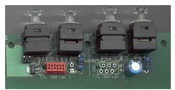
Figure 1: Toslink Adaptor

To software the interface remains the same as RS232 and USB: It is still a comport interface.